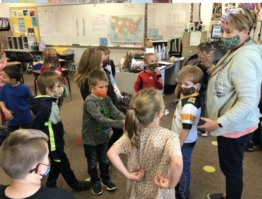
Rock Paper Scissors—OUT!