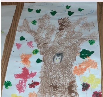
3rd Grade Dot Art