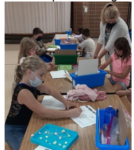
3-D Shapes and Design